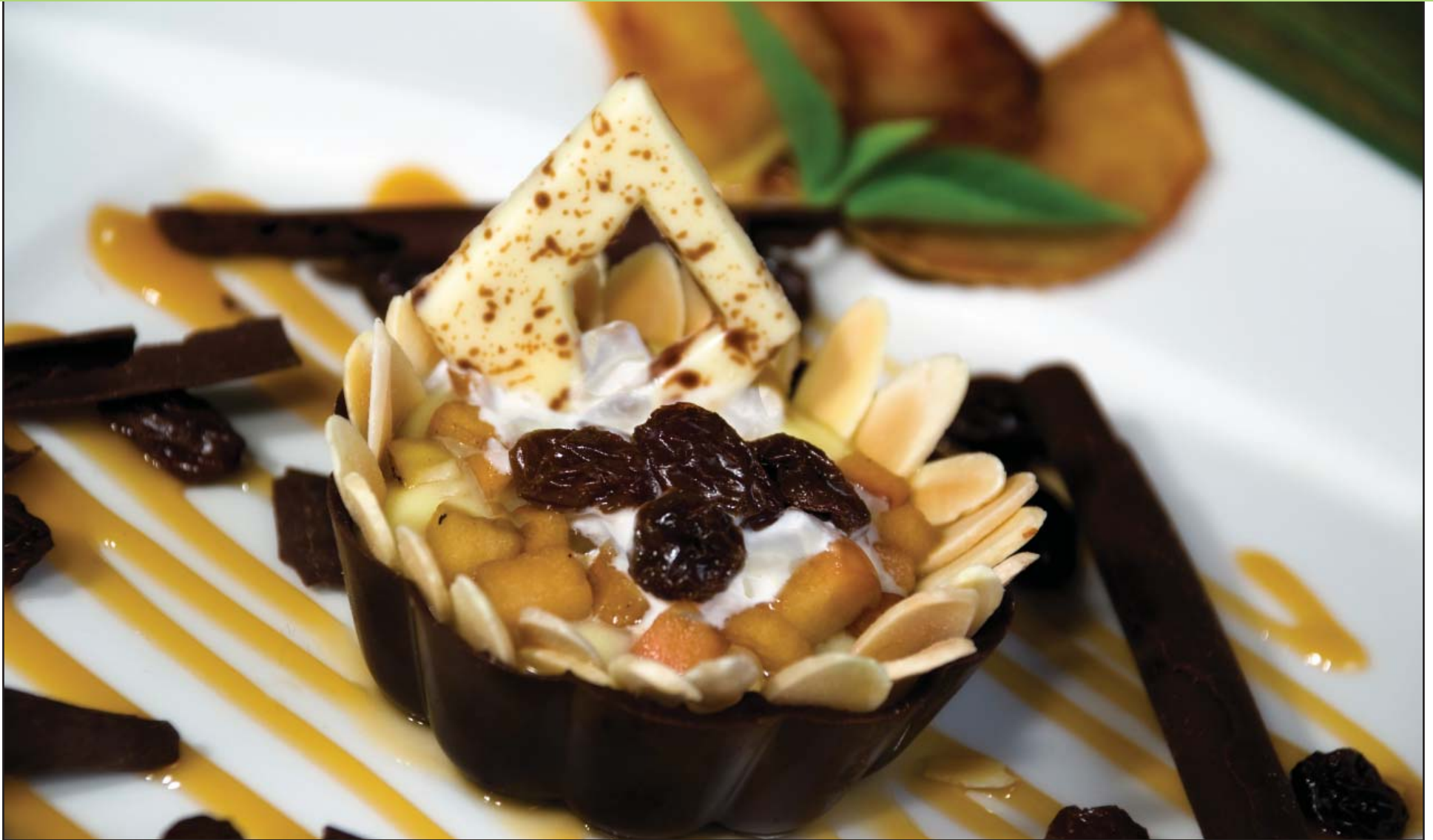
Chocolate Caramel Apple Almond Cup