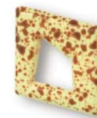
Blizzard L932-06 (W 1.5" x H 1.9") 6 x 280 pcs/case